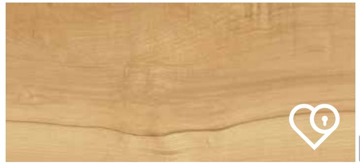
3431 APPLE TREE