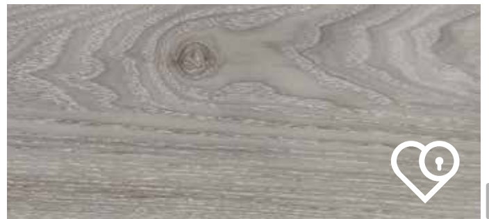
3427 GREY MOUNTAIN ASH