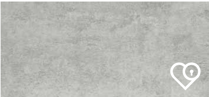
3452 GREY FLAGSTONE