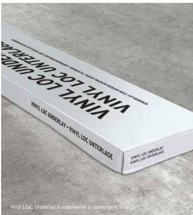
Vinyl LOC Underlay is supplied in a convenient box