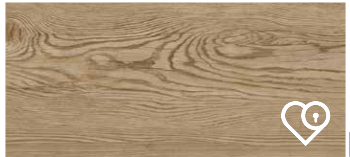
3439 HICKORY OAK