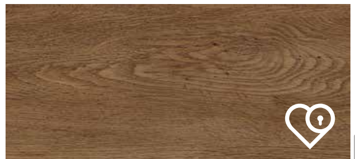
3436 LAUREL DARK OAK