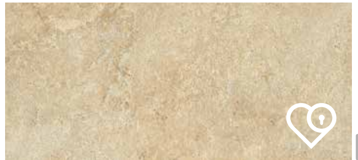
3455 CLASSIC YORKSTONE