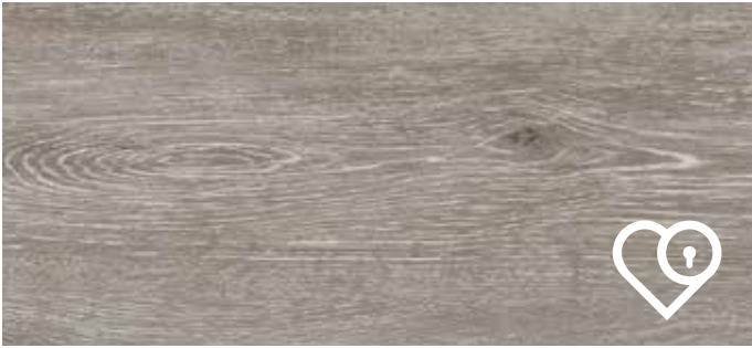
3437 SMOKE LIMED OAK