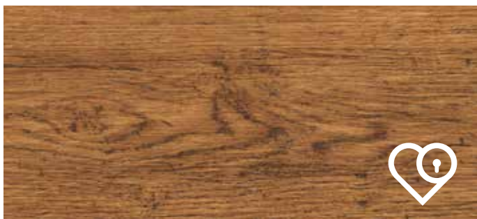
3446 VINTAGE TIMBER