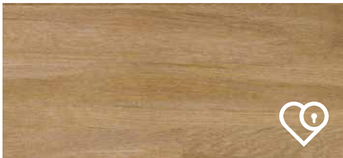
3442 EVERGREEN OAK