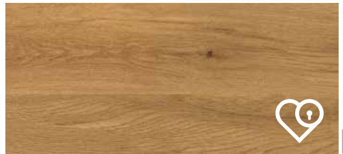
3443 BUTTERNUT OAK