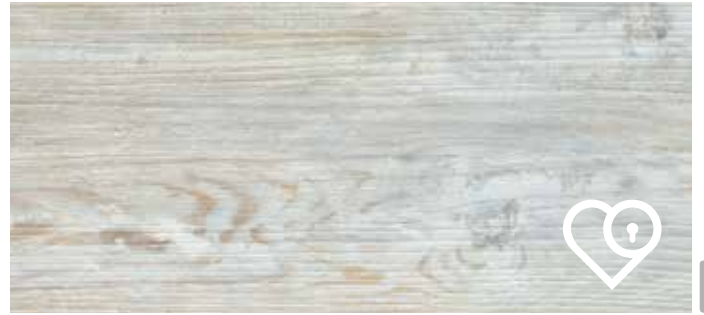
3441 WHITE LIMED OAK