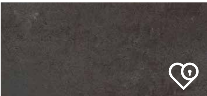
3453 BLACK SHADOW SLATE