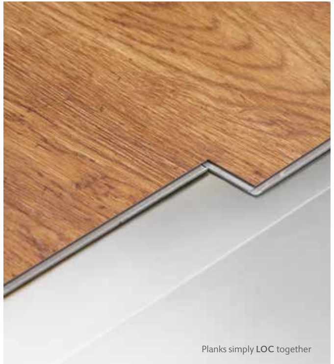
Planks simply LOC together