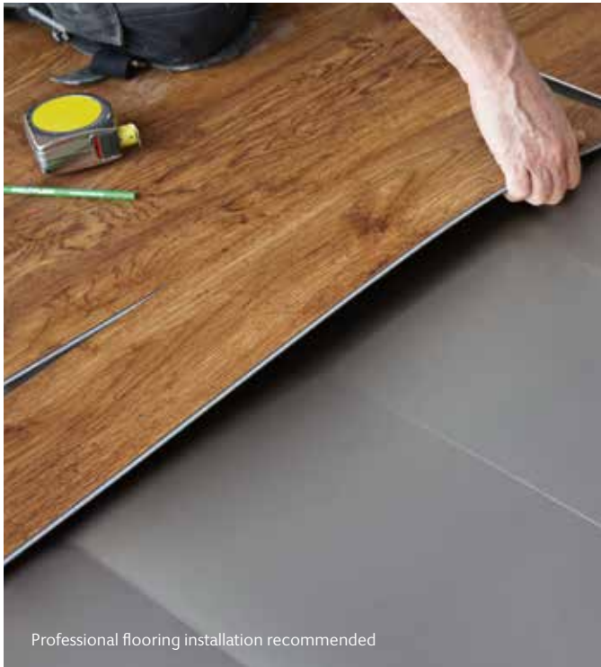
Professional flooring installation recommended

To ensure your new floorcovering continues to perform year after year, together with our floorcare guidelines on page 44 we also recommend that all our Camaro Loc designs are fitted by a professional flooring installer, over a suitable interlocking vinyl flooring underlay such as Polyflor's Vinyl Loc Underlay . Designed to prevent the planks sliding or becoming damaged due to uneven subfloors, our Vinyl Loc Underlay also acts as a shock-absorber when walked across and reduces the impact sound transmitted through neighbouring rooms. It is also suitable for use over underfloor heating due to its low thermal resistance, giving you a floorcovering that is stable, even, quiet and comfortable for your whole family to walk on.