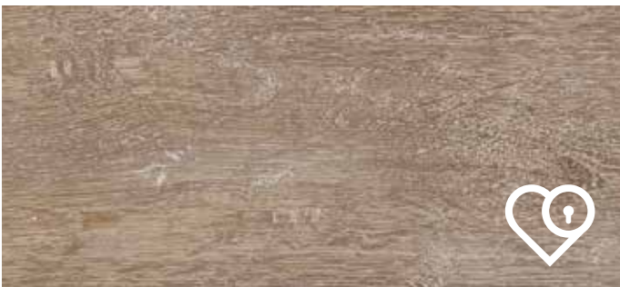
3438 TAN LIMED OAK