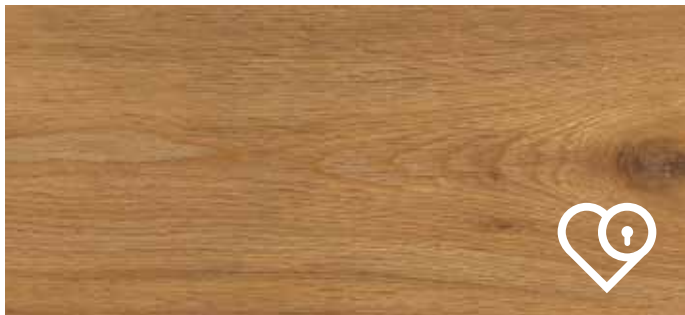
3432 RICH VALLEY OAK