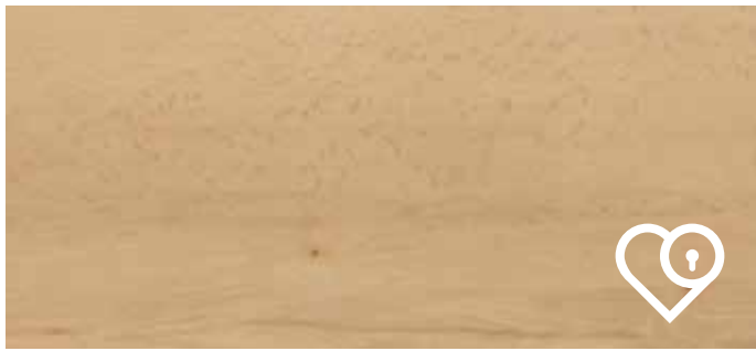
3429 SUMMER MAPLE